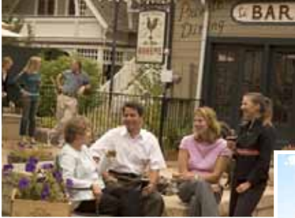
Downtown and trolley photos