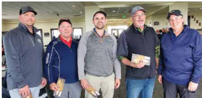
First Place Team