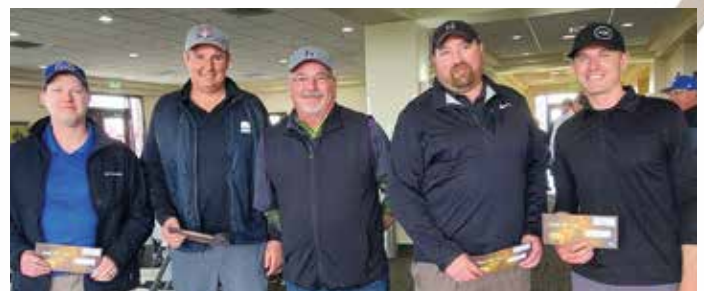
Third Place Team

Entering year three of pandemic disruption, Idaho's economy is booming with one of the highest growth rates in the country. The state continues to see astonishing levels of surplus tax revenue and has been swamped with federal COVID – relief funds.