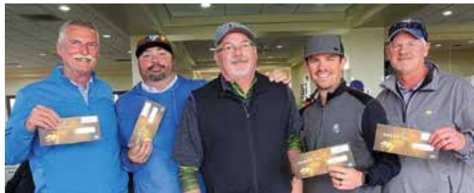
Second Place Team

Watch your email and the WPMA website for Idaho's PAC golf event calendar. We will have events in Magic Valley at Canyon Springs on June 30, at Circling Raven on August 3, and Teton Reserve in Victor, Idaho in late August/early September. These outings are an opportunity to