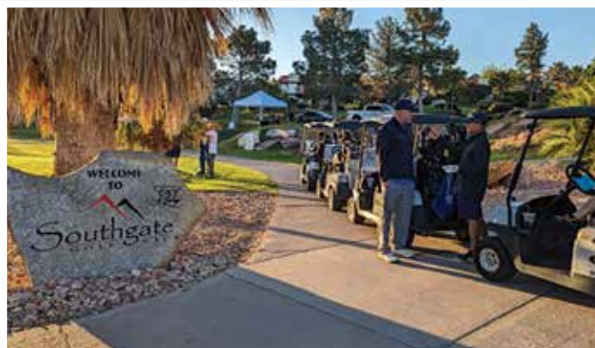
A few 2023 UPMRA Convention snapshots

THE UTAH PETROLEUM MARKETERS & RETAILERS ASSOCIATION ST. GEORGE, UTAH •