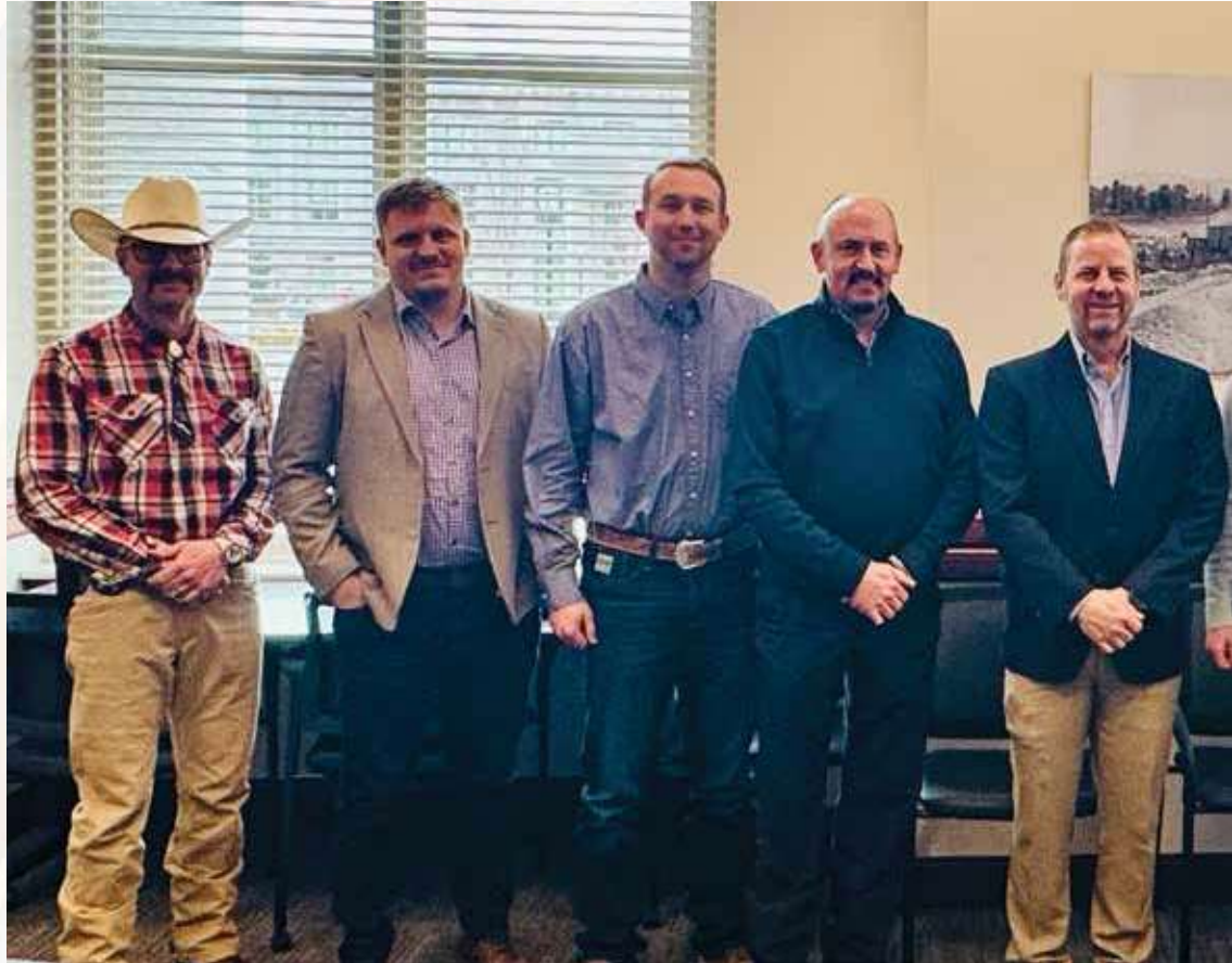
The UPMRA Board at their Day on the Hill meeting