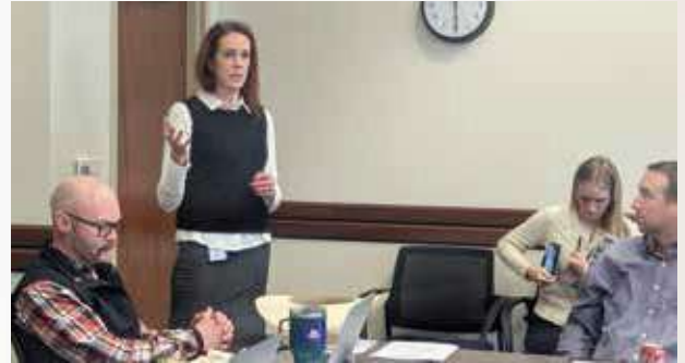
Representative Provost discusses legislation with the UPMRA Board